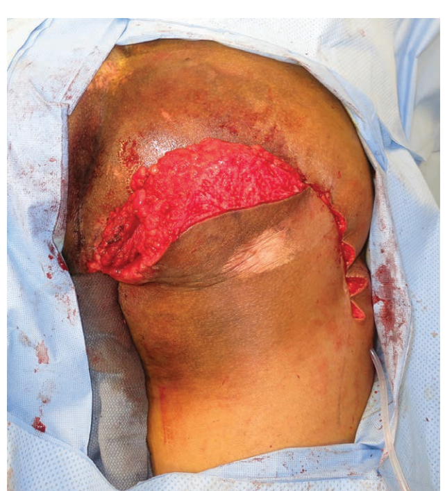
Fig. 3. Rotation of flap performed with deepithelialization of flap edge.

similar preoperative treatment was provided. In the COP group, 2 ischium ulcer patients and 1 sacral ulcer patient had local rotational skin flaps performed at community