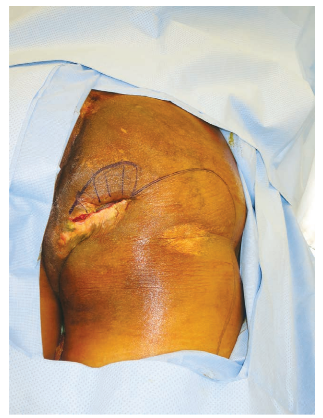
Fig. 2. Clinical case of ischial pressure ulcer. Rotational flap and obliterated space is outlined.