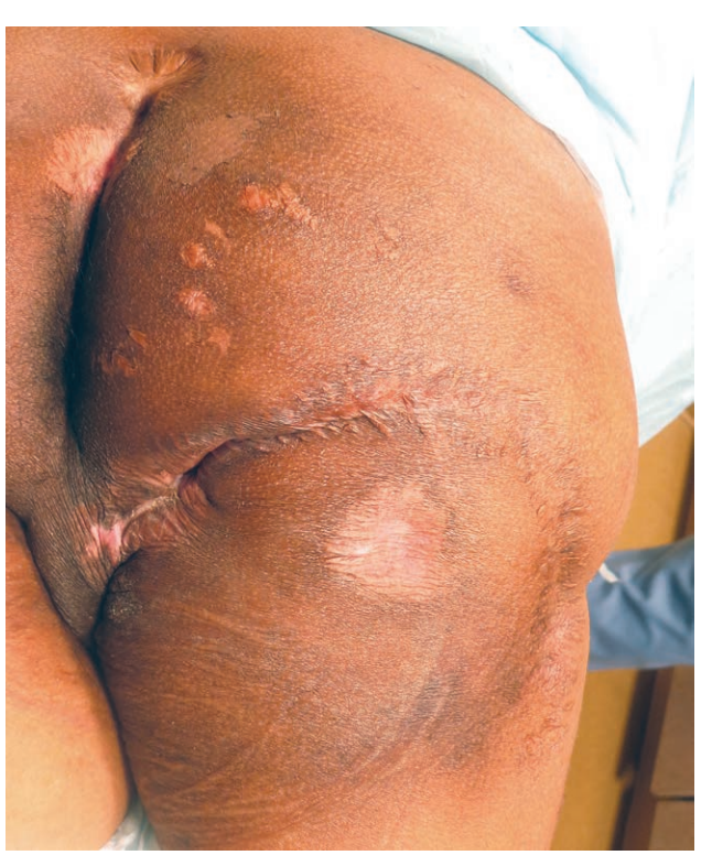
Fig. 5. One-month postoperative result.

similar preoperative treatment was provided. In the COP group, 2 ischium ulcer patients and 1 sacral ulcer patient had local rotational skin flaps performed at community