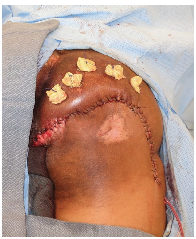
Fig. 4. Deepithelialized edge inset and sutured into place with bolsters to prevent skin necrosis.